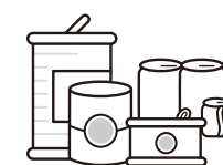
Metal & Aluminum